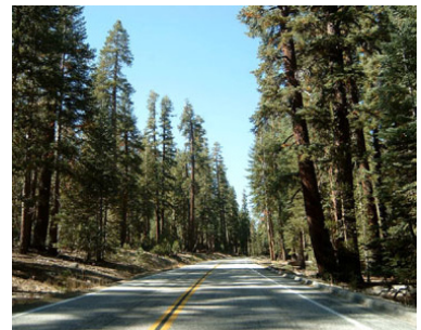
Redwood National Park